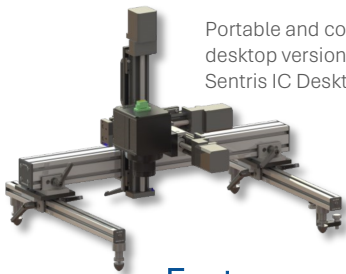
Portable and compact desktop version, Sentris IC Desktop-XYZ