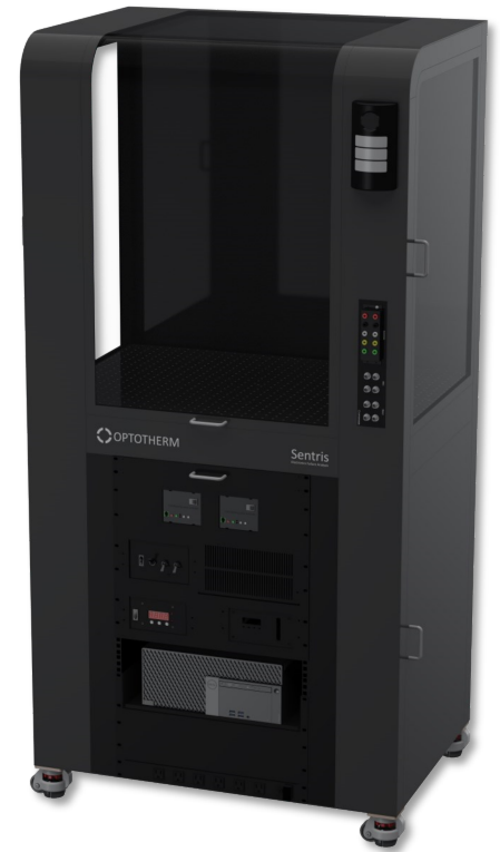
The Freestanding Test Enclosure 600 contains a 19" standard 18U rack, locking casters, and light tree, in addition to the basic enclosure features listed below.